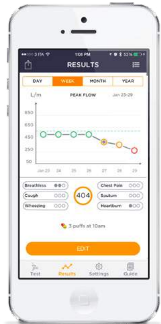
Graphic trend of Peak Flow or FEV1